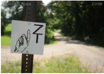
A sign promoting Zane's Trace is displayed at the intersection of East Wheeling and Rustic Ridge roads.