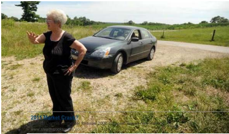
Show Caption | View Thumbs | Purchase Image | 1 of 7

Be the first of your friends to recommend this.