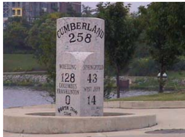
A milestone in Columbus, Ohio, marks the path of the National Road.